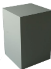
› AR163 › AR164 › AR165